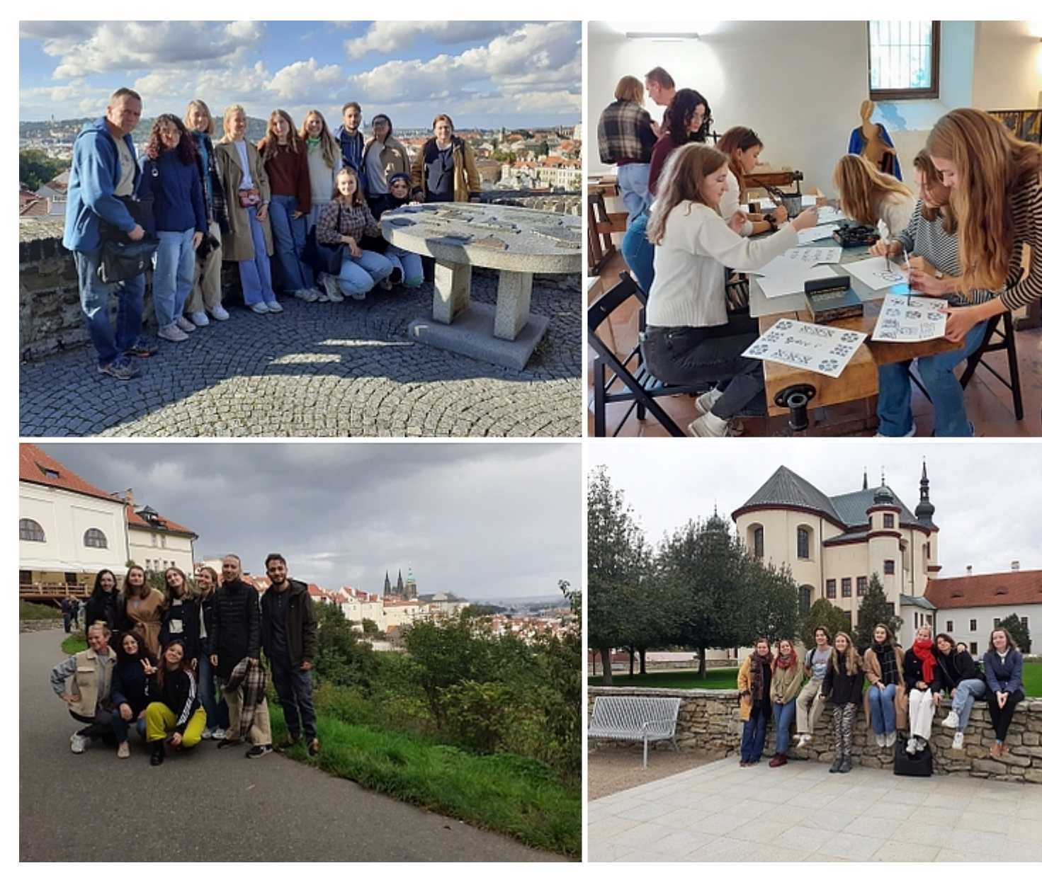
Orientation programme 2022/23 - Summer Semester